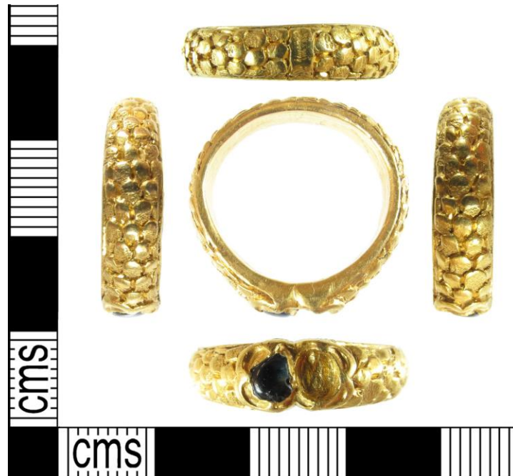
Image 6 - 2019 T195 Post-Medieval gold and gemstone from Whaddon, Buckinghamshire