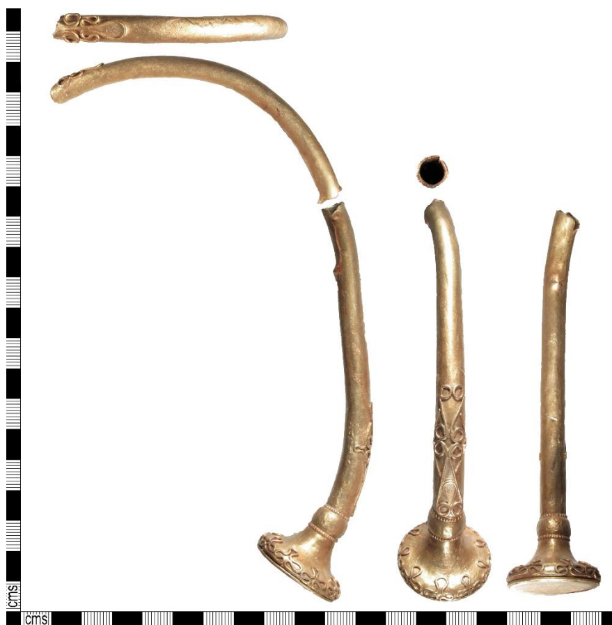
Image 2 – Iron Age gold torc fragment from Pulborough area, West Sussex