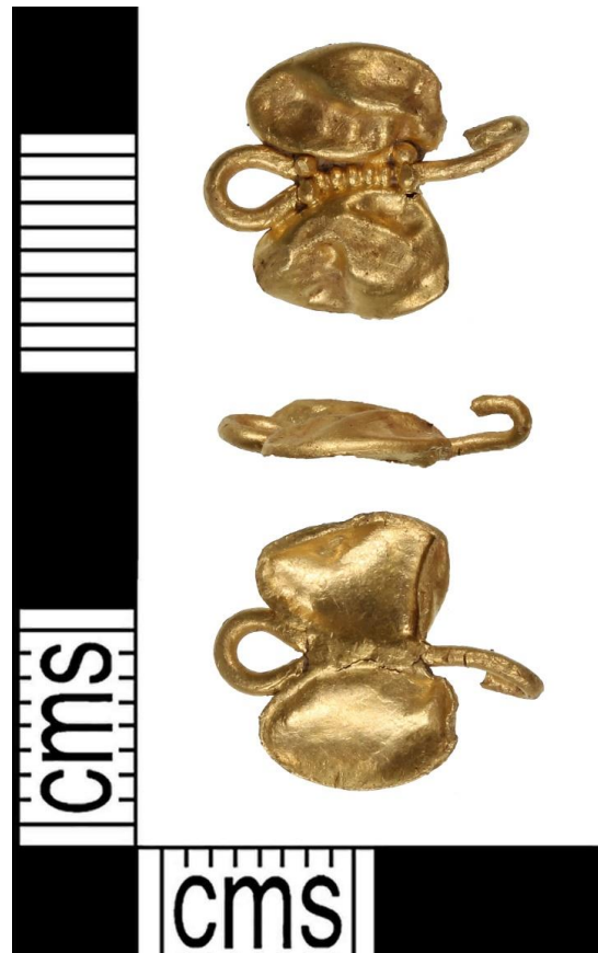
Image 3 – 2019 T571 Roman gold jewellery piece from near Sandwich, Kent