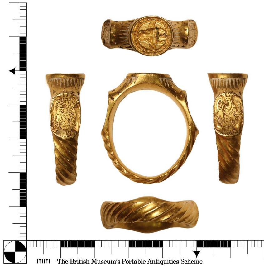
Image 5 – 2019 T729 Late Medieval iconographic ring from Eastchurch, Kent