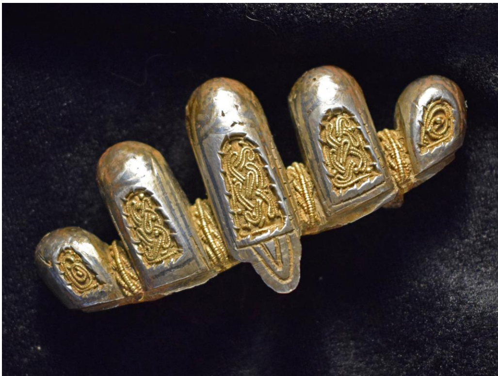
Image 4 – 2019 T861 Early Medieval silver and gold filigree sword pommel from Brigstock, Northamptonshire