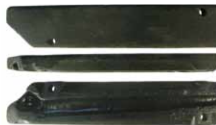
Vervel from Micheldever, Hampshire (HAMP-039157) 13.5mm x 0.65mm