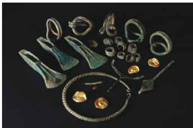
The near Lewes Hoard (SUSS-C5D042)

If someone finds something that they believe is Treasure, or is not sure whether it is Treasure or not, it is best they contact their local FLO for advice.