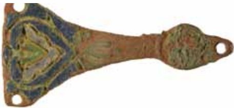
Badge of St George from Cumbria (LANCUM-4501B2) 40mm x 9mm x 5mm and 30mm x 15mm x 4mm

Two important 14th-century coins were also recorded: a farthing of the Berwick-on-Tweed mint under Edward III (r. 1327–77) from Thwing, East Yorkshire (NCL-D6B492); also, a previously unrecorded penny type from the Calais mint for Henry VI (r. 1421–61) which was found at Bedale, North Yorkshire (DUR-88FA74). This may represent part of the last group of dies sent to Calais before the mint closed in c. 1450; Calais was finally lost to the French in 1558.