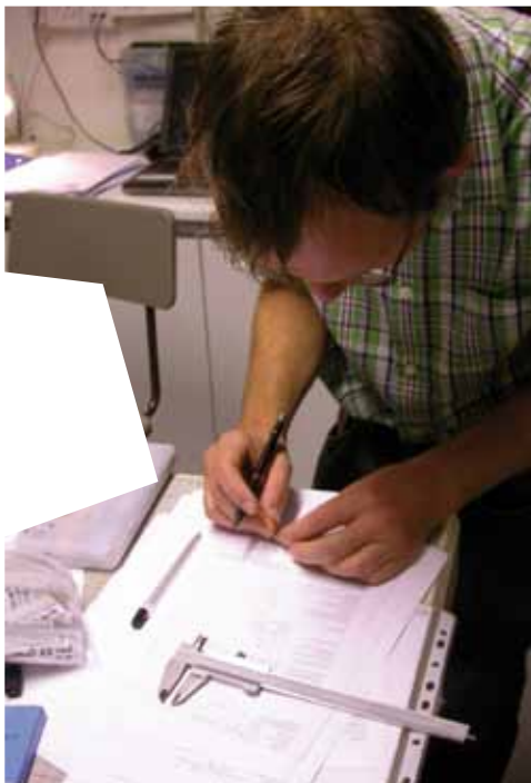
Filming Britain's Secret Treasures