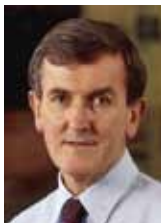
Neil MacGregor Director of the British Museum

We are pleased to introduce this report on the work of the Portable Antiquities Scheme (PAS) and Treasure Act 1996, which also highlights some fascinating and important finds reported in 2011. We are especially grateful to Treasure Hunting who once again agreed to publish this report free within their magazine.