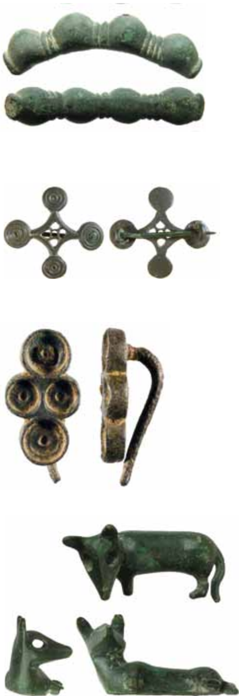
Bracelet from Bishops Waltham, Hampshire (HAMP-93A632) 33.6mm x 10.4mm x 6.65mm