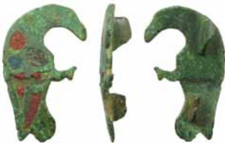
Vessel fragments from Crowle, North Lincolnshire (FAKL-9900E3) 107mm x 41mm x 2.2mm