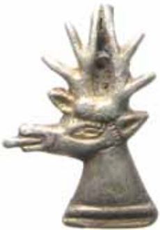
Badge of St Thomas' gloves from Greenwich, London (SUR-E42C11) 21.75mm x 11.07mm