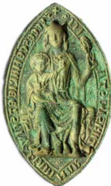
Seal matrix from Cobham, Surrey (SUR-B74173) 73.45mm x 44.28mm x 6.26mm