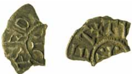
Penny of Offa of Mercia (r. 757–96) from the Isle of Wight (IOW-C8BD83) 16.7mm