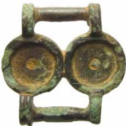
Strap-union from Horncastle, Lincolnshire (SWYOR-50E5F6) 27.08mm x 26.93mm x 7.43mm