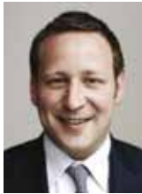
Ed Vaizey Minister for Culture, Communications & Creative Industries