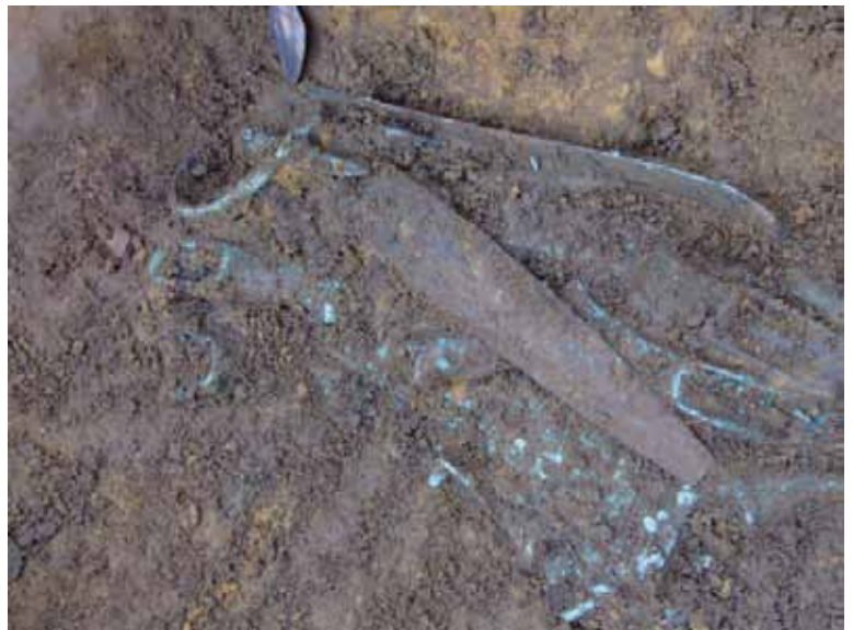
The Vale of Wardour Hoard, as found (WILT-E8DA70)

External funding has contributed enormously to the ability of museums to acquire Treasure finds, and therefore we are particularly grateful to the Art Fund, the Headley Trust, the Heritage Lottery Fund, the National Heritage Memorial Fund and the V&A Purchase Grant Fund, as well as various individuals. We should also like to thank those finders and landowners who have generously waived their right to a reward, allowing museums to acquire such finds at reduced or no cost. Finally we would like to thank the members of the Portable Antiquities Advisory Group, who have provided the PAS with important guidance, and the Treasure Valuation Committee members, who have provided expert advice to the Secretary of State.