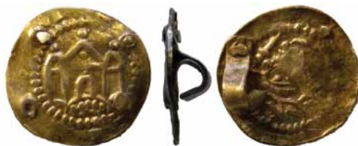
Coin brooch made from a denier of Bishop Conrad of Utrecht (r. 1076–99) from Bradenham, Norfolk (NMS-66F9A5) 14mm