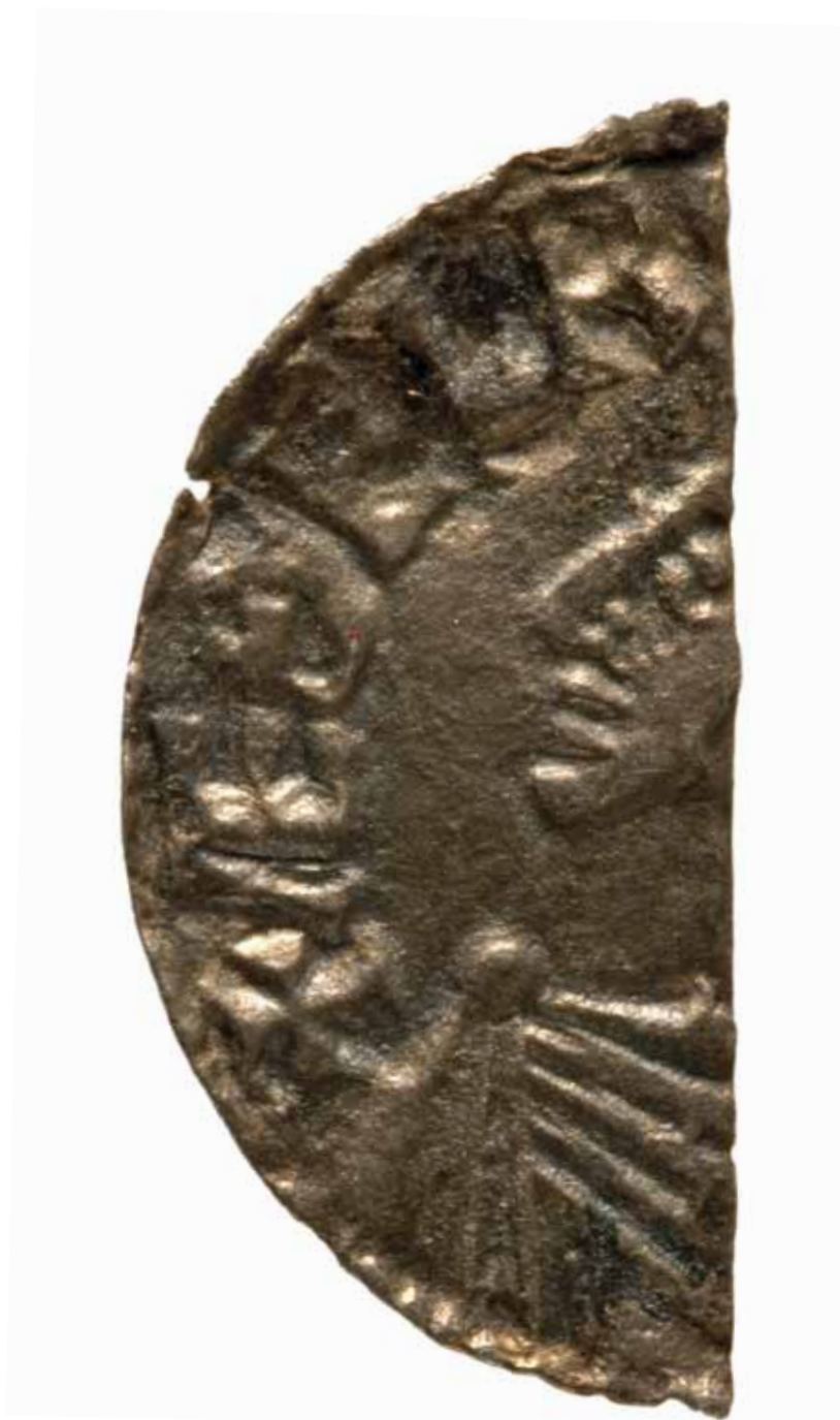
Cut half-penny of Æthelred II (r. 978–1016) from Laugharne Township, Carmarthenshire (PUBLIC-8CC232)