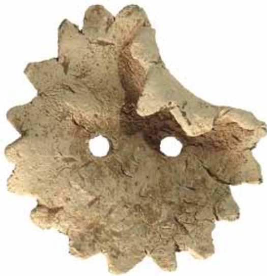
Buzz-wheel from the Isle of Wight (IOW-22A881) 40.4mm x 1.6mm