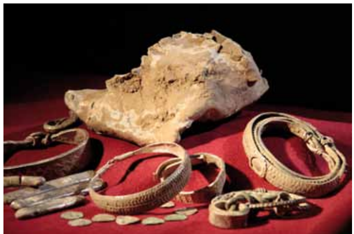
The Silverdale Hoard (LANCUM-65C1B4)