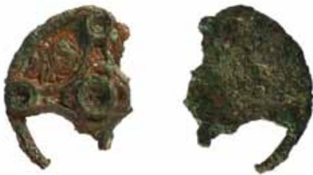
Romano-British harness fitting (NCL-74DE87) donated to the Great North Museum, Newcastle-upon-Tyne 51.12mm x 46.68mm x 11.91mm